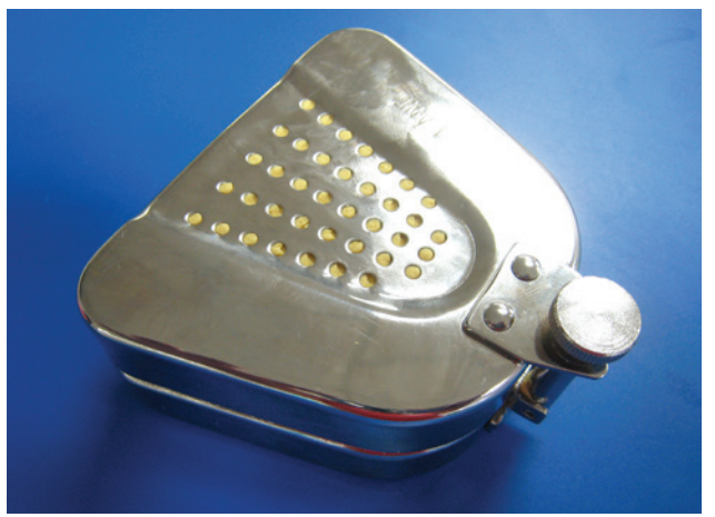
Figure 14. Clean up excess.