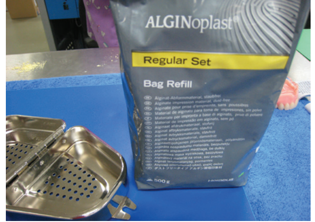
Figure 3. Use a regular set alginate - it gives you a bit more working time.