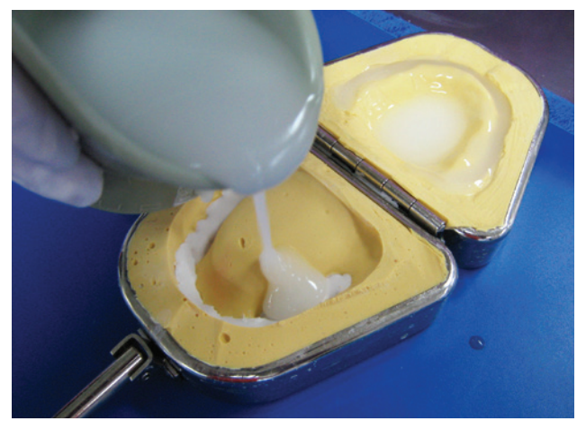
Figure 20. Mix clear acrylic and pour into both sides of mould.