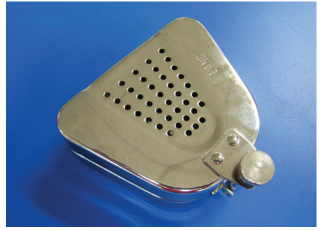
Figure 1. Lang Dental's Denture Duplicator Flask is very useful for making scan appliances.