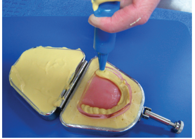
Figure 11. I like to use an alginate syringe to fill the fitting side.