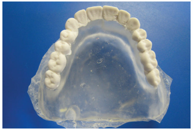
Figure 24. The cured radiographic guide.

existing denture or diagnostic wax-up and this can now be done very easily using the Lang Dental's Denture Duplicator Flask. Lang's barium sulphate premixed acrylic is ideal for use with these appliances and comes in two opacities - 40% Opaque and 20% known as "Shadow". Variations on scan appliances include transparent