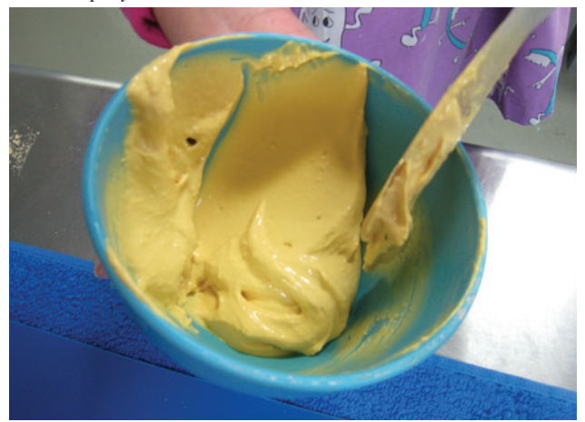
Figure 4. Mix the alginate to a suitable consistency.