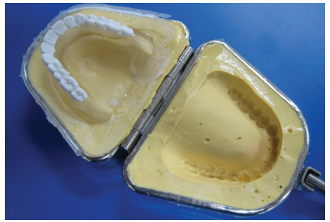
Figure 23. When cured, take flask out of the pot, open and remove.