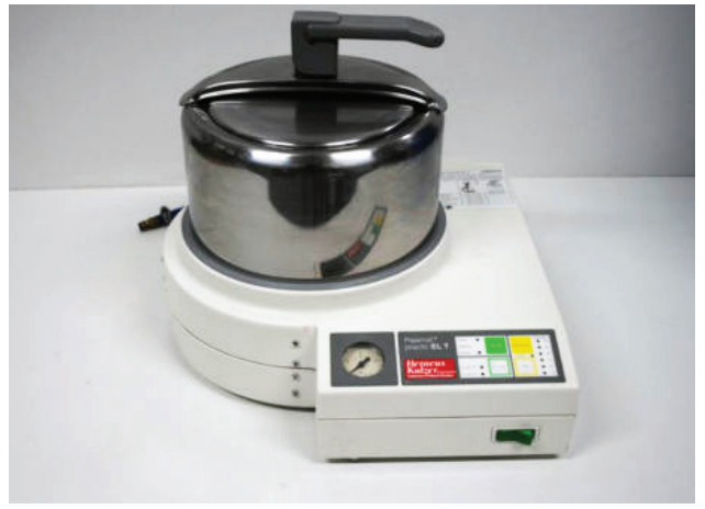
Figure 22. Cure the acrylic for 15-20 minutes in a warm pressure pot. Don't make it too hot!