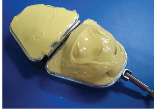
Figure 12. Cover the denture with alginate.

Commercial acrylics are now available to help solve this issue such as Lang Dental's JET XR<sup>™</sup> Radiopaque Acylic (Figure 16). Opinions on adding of barium sulphate vary, some say it may affect the quality of the scan, however one could argue when