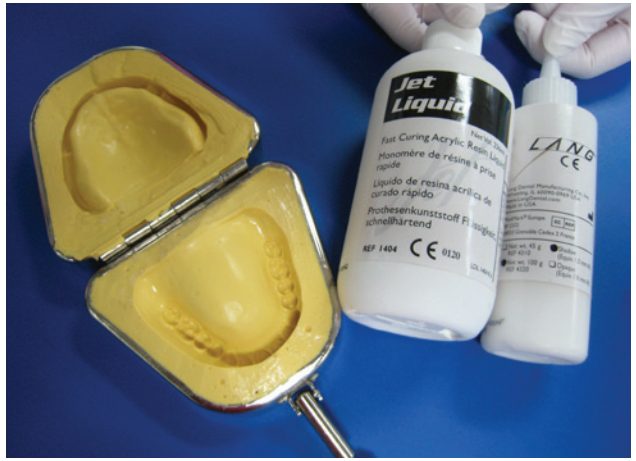
Figure 16. Lang Dental's JET XR self-curing acrylic with Barium Sulphate; this is opaque with 40% Barium Sulphate.