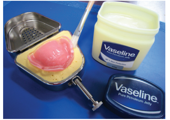
Figure 9. Use Vaseline on the alginate to separate the two halves.