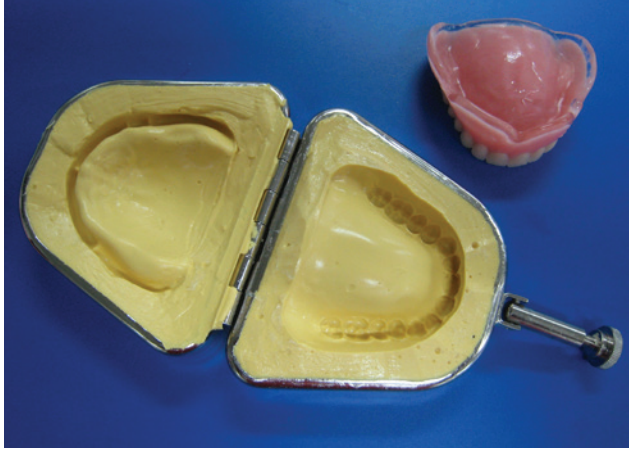
Figure 15. When the alginate has set, carefully open the flask and remove the denture.