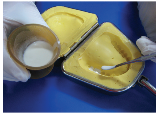
Figure 18. Use an instrument to dispense the acrylic into the tooth section of the mould.

radiopaque fiducial or reference markers into the scan appliance. Often gutta-percha used in root canal treatments is used but other radiopaque materials are suitable too. Taking a CBCT scan with the patient wearing the scan appliance and another