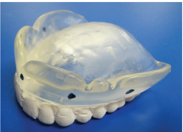
Figure 26. Mark areas for gutta-percha fiducial markers.