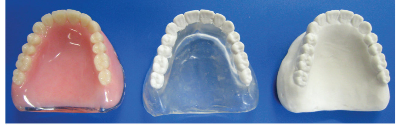
Figure 30. Denture and two different types of guides. The middle one uses clear acrylic for the base and Lang Dental's JET XR for teeth. The one on the right uses Lang Dental's JET XR 40% for the teeth area (opaque) and 20% for the base (Shadow).